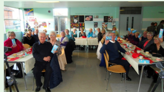
The guests with their gifts

If you know of a senior citizen who would like to attend next year, please ask your son or daughter to nominate them. There is no charge and we provide transport for those who are unable to get themselves to the school. The only restriction is that nominees must live within the catchment area (Bedlington, Bedlington Station, Choppington, Guidepost, Stakeford, Cambois and North Blyth).