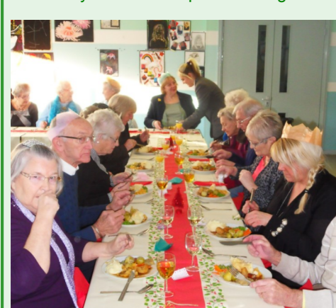
The guests enjoy a turkey dinner with all the trimmings