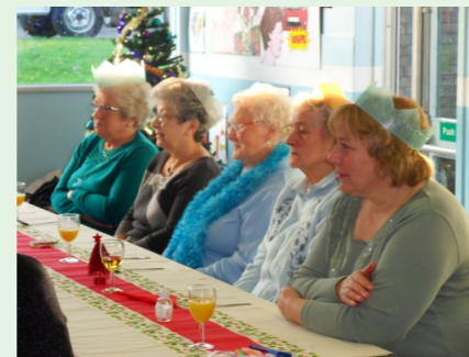
Enjoying the entertainment